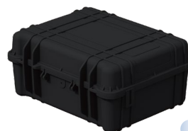
Box closed state

Through in-depth analysis of UAV signals, it can accurately detect the SN code, model, positioning, trajectory, time, distance, and other relevant information of all UAVs within the warning range. Moreover, it provides corresponding information on the position of the UAV remote pilot.